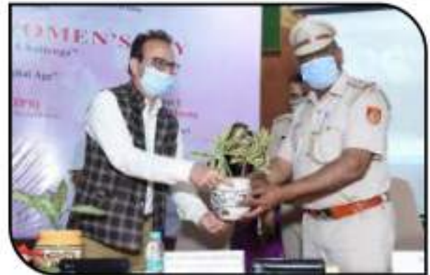
International Women's Day Celebration at Jamia Hamdard