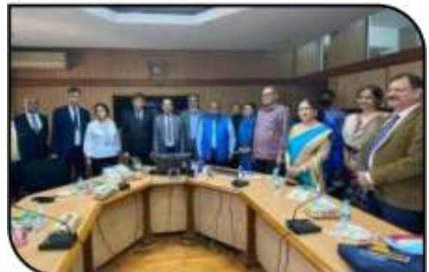
Visit of Apex level delegation from Uzbekistan to Jamia Hamdard