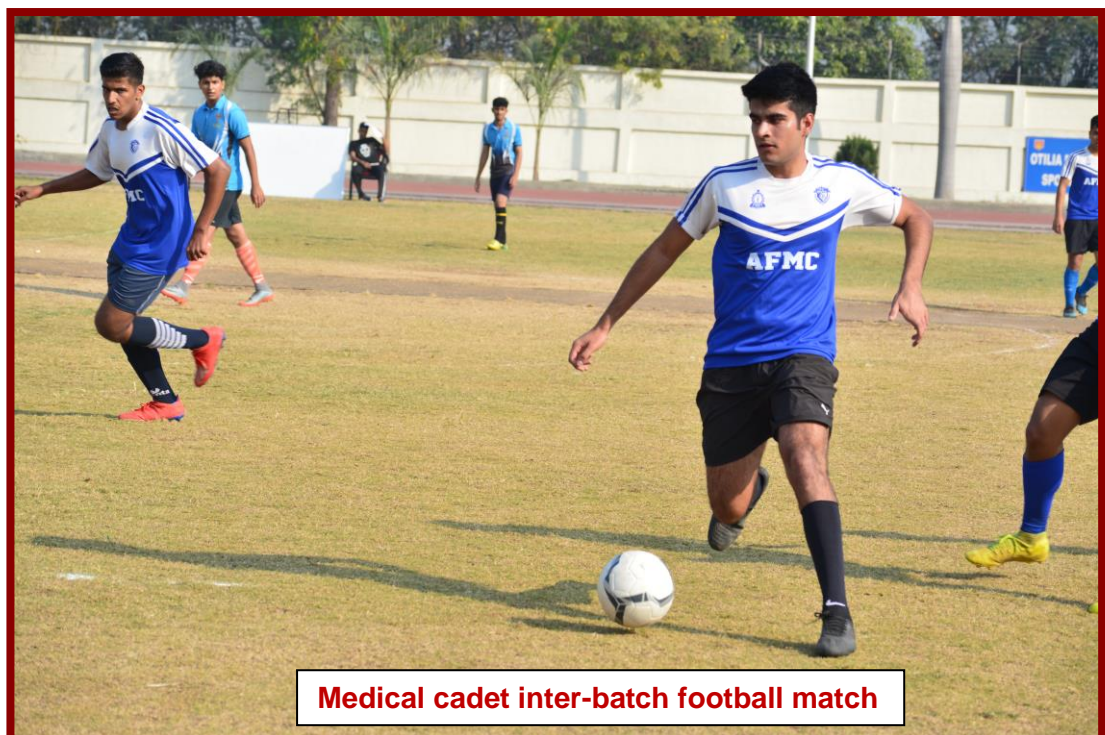
Medical cadet inter-batch football match