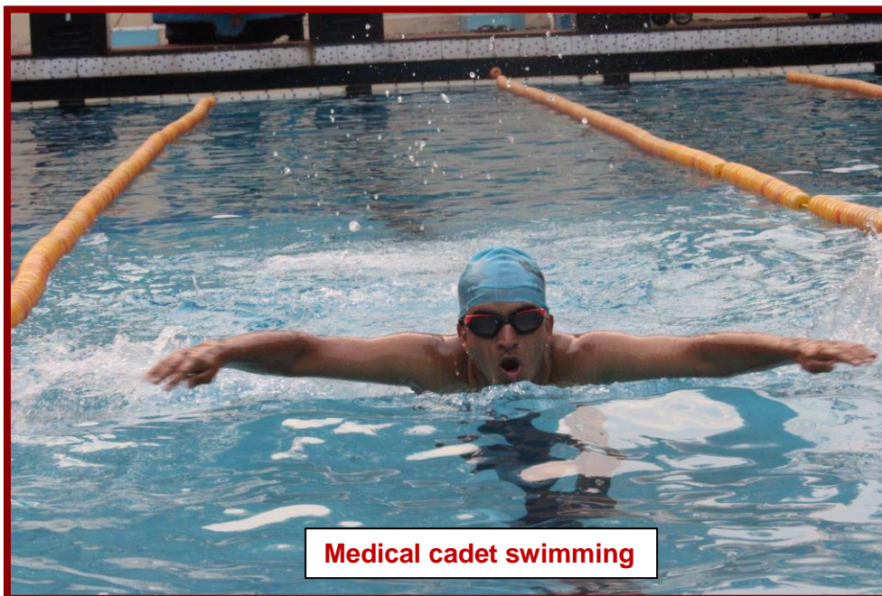
Medical cadet swimming

NOTE: The above concessions / facilities are subject to amendment without notice as per Govt orders issued from time to time.