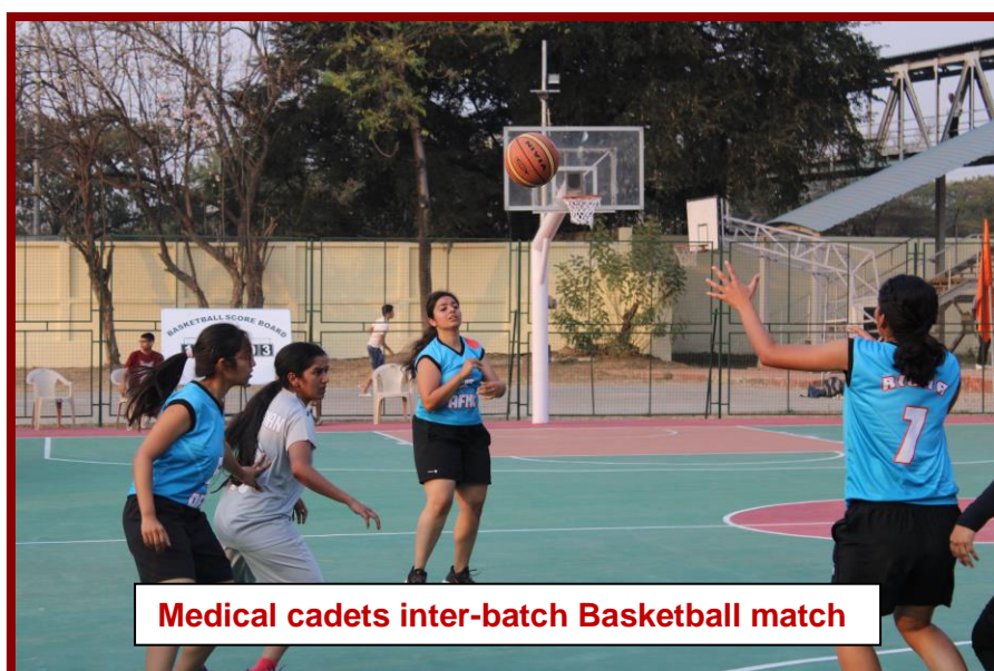
Medical cadets inter-batch Basketball match

39. Fees and other charges payable by medical cadets will be given in the joining instructions published online along with merit and waiting list on websites: www.afmc.nic.in & www.afmcdg1d.gov.in