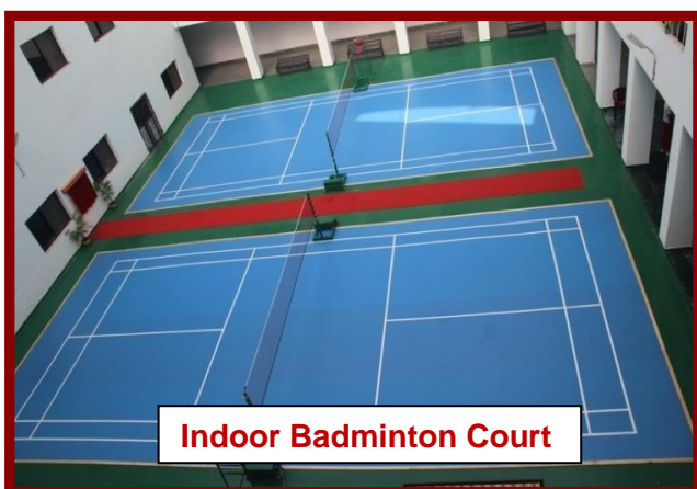
Indoor Badminton Court