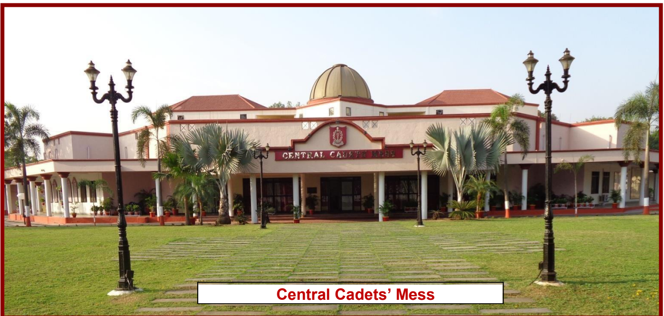
Central Cadets' Mess

30. Messing Facility: All medical cadets residing in the hostel are required to be members of the Mess attached to the hostel. Vegetarian / Non-vegetarian food is served in the cadets' mess as per the choice of the medical cadets.