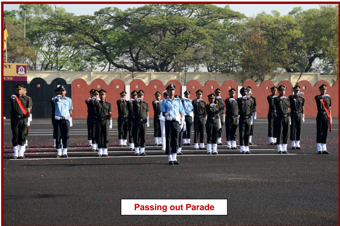
Passing out Parade

35. Medical cadets are required to be punctual and regular in attending classes and shall appear at all tests and examinations. If medical cadet's attendance or academic performance is not up to the required standard, he / she may be detained for the term. Disciplinary action will be taken against cadets for being absent from classes.