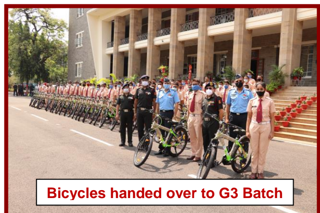
Bicycles handed over to G3 Batch