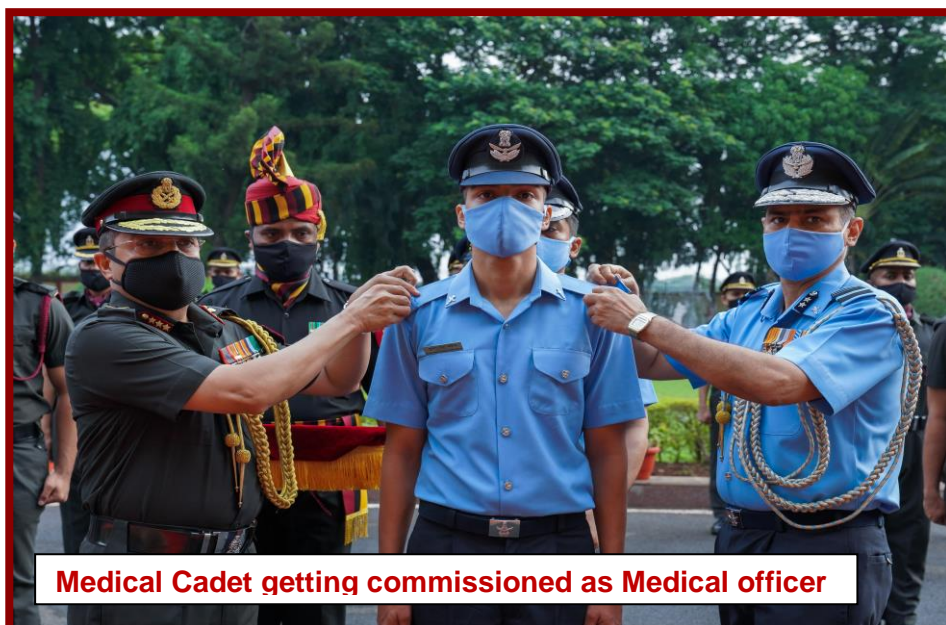
Medical Cadet getting commissioned as Medical officer

(e) Higher Secondary School Certificate examination of Maharashtra State Board of Higher Secondary Education with English at Higher level, anyone of the Modern Indian or Modern Foreign or Classical Languages, Physics, Chemistry, Biology and Mathematics or any other elective subject.